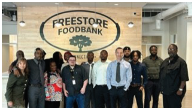
Pictured: The 21st graduating class of LIFT the TriState.

Thank you for supporting important programs like this that are helping individuals find the second chance they are looking for. And right now, your support goes twice as far, thanks to a matching gift!